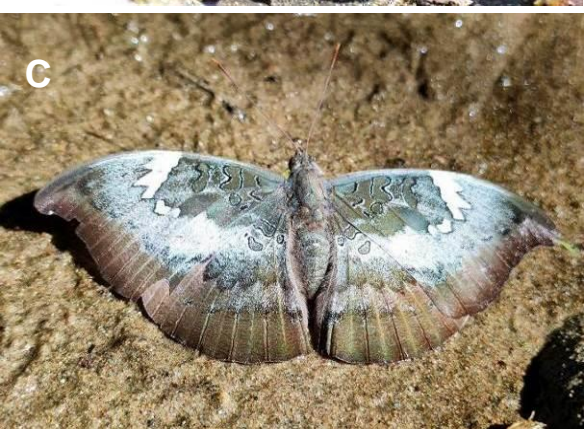
Figure 2. Individuals of (A) Ancema blanka , (B) Faunis canens , and (C) Euthalia anosia

These findings help fill previous gaps on species distributions and suggest further surveys to compile a complete checklist of butterflies of Bangladesh for a better understanding of distribution patterns, and ecology, and to take future actions in any conservation initiative.